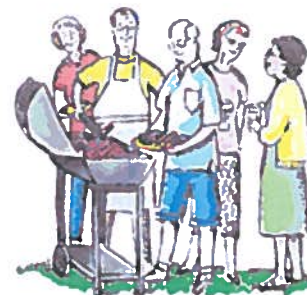
Senior Adults Cookout