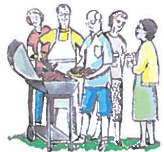
Senior Adults Cookout